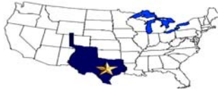
A whole other Country God's Texian Country