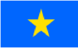
Texas republic National Standard