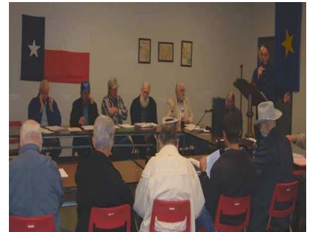
Our Representatives At Work