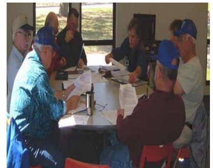
SENATORS AT WORK